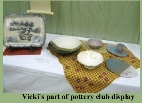
Vicki's part of pottery club display