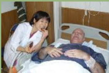
A typical hospital room