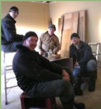
Break time at the Minks