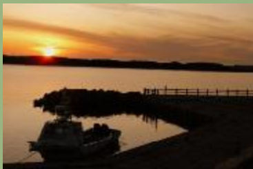
September Teshio Sunset