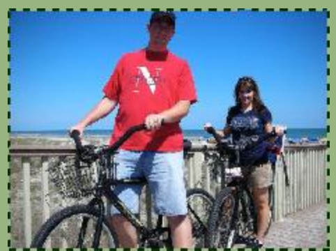
On our family vacation together in April