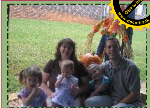
Local Fall School Festival